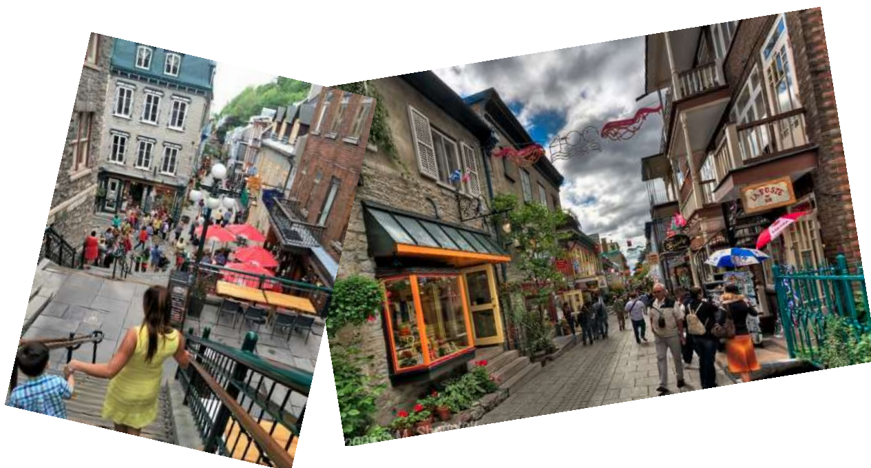
Breakneck Steps & Lower Town